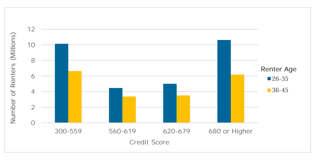
FIGURE 2: CREDIT SCORE DISTRIBUTION FOR RENTERS, AGES 26-45

households: Figure 2 presents data from the Urban Institute on the distribution of credit scores for renters between the ages of 26 and 45, those most likely to want to buy a home. Only 30 percent have credit scores above 680. Meanwhile, nearly 20 percent of young renters—over 8.5 million individuals—have credit scores between 620 and 680, suggesting that though it is currently just out of reach, they could successfully sustain homeownership with the right mortgage product and support.