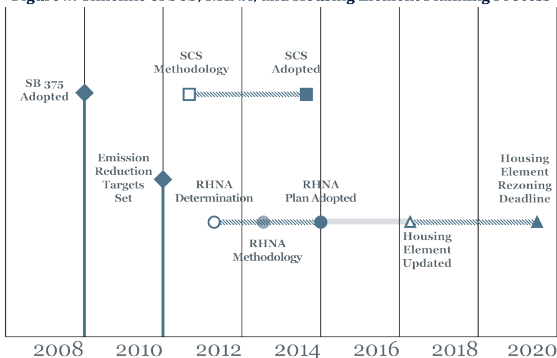
Figure 2. Timeline of SCS, RHNA, and Housing Element Planning Process

Exact individual MPO timelines may vary.