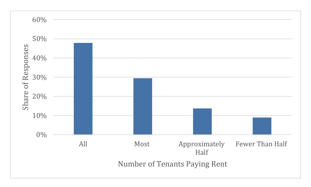
Figure 1. Landlords Reporting on the Number of Tenants Who Paid Rent Last Month

• 57% of landlords reported that rent collections are down from the first quarter, with 30% of respondents saying they are down more than 25% (Figure 2)